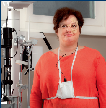
Patient wearing the SENSIMED Triggerfish® device either ambulatory or in-hospital use.